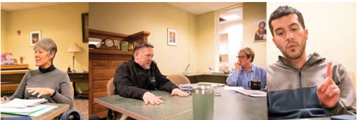
Episcopal News Service