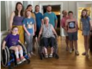
image to join our team!!!