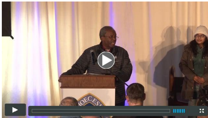
Bishop Michael B. Curry Bellwether Farm Dedication

Trinity Church | 419-243-1231 | trinity@trinitytoledo.org | http://www.trinitytoledo.org 316 Adams St Toledo, OH 43604