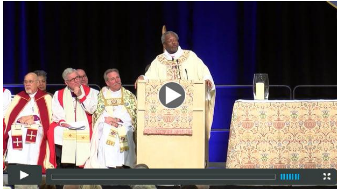
Episcopal Diocese Convention Nov 11 Sermon

For those who did not attend the Diocesan Convention the sermons of Bishop Michael Curry are below. His words to us are not to be missed!