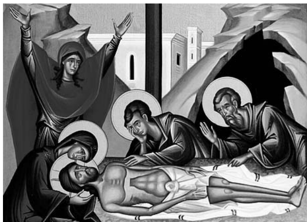
Icon of the Epitaphios Thrinos

During Holy Week, we live in two time zones. One is our own: the one where we need to get to work by nine, where the cable bill is due on Tuesday and the dog has to be walked before bed. This is the time zone where, for us, Easter comes around every year, on the first Sunday after the first full moon on or after the vernal equinox according to the Gregorian calendar.